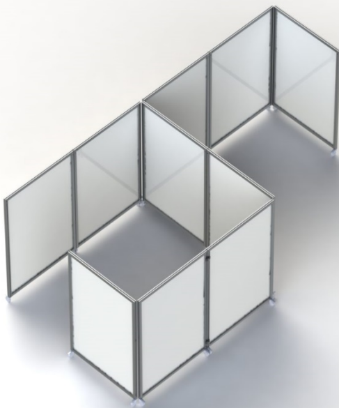
Layout A - (can be duplicated to make Layout B)