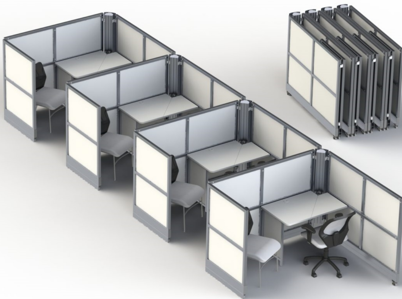
Flu/Triage Stations - chairs not included

Current Quick Ship available only in white laminate.