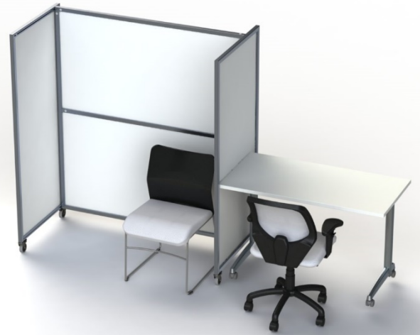
T-wall sample setup - chair and table not included