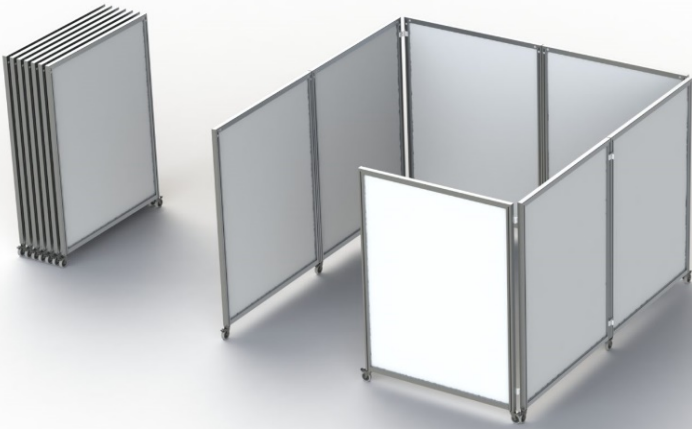
Quick setup treatment room