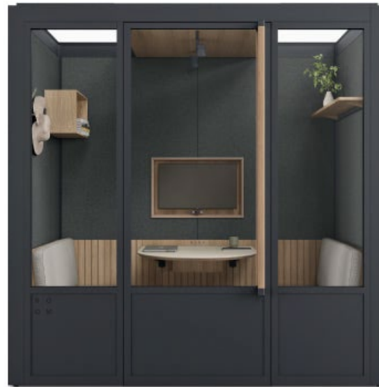
ROOM Meeting Room