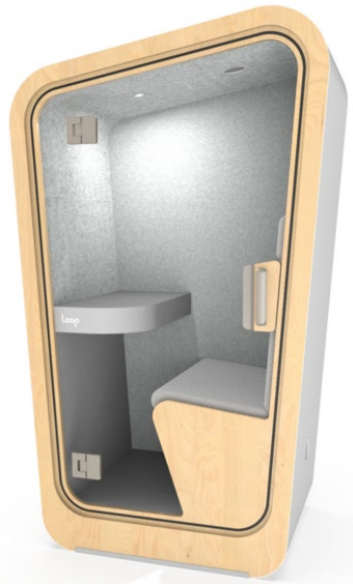
Loop Solo QS