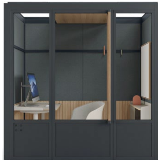
ROOM Focus Room