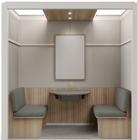
ROOM Open Meeting Room