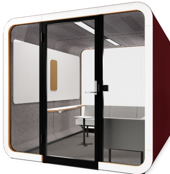
Framery 2Q Lounge