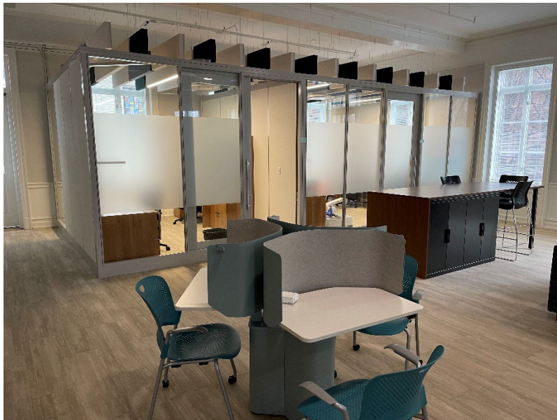
Environamics Walls & Frasch Baffles