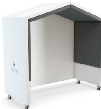
NOOK Open Booths