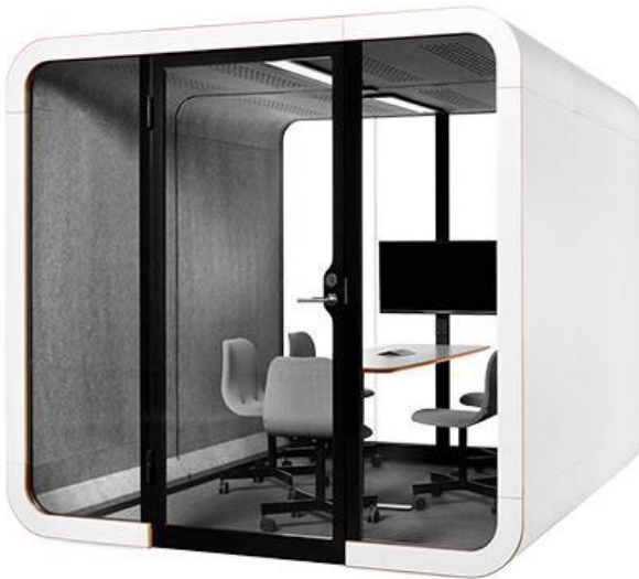
Framery 2Q Huddle