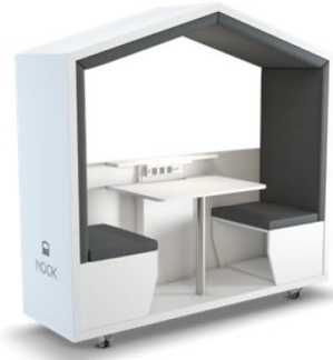
NOOK Huddle Booths