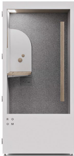
ROOM Phone Booth