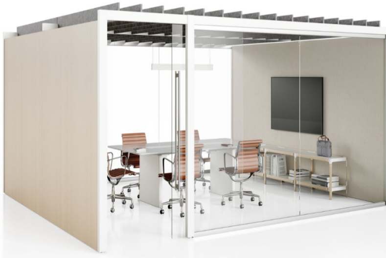
Herman Miller Overlay Walls