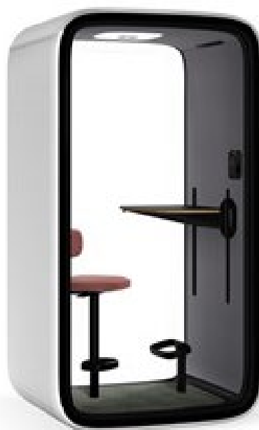
The New Framery One