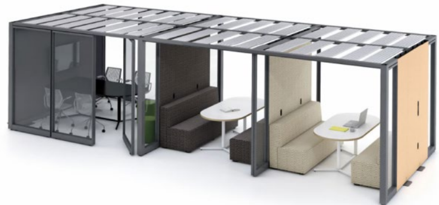
Knoll Unscripted Creative Wall