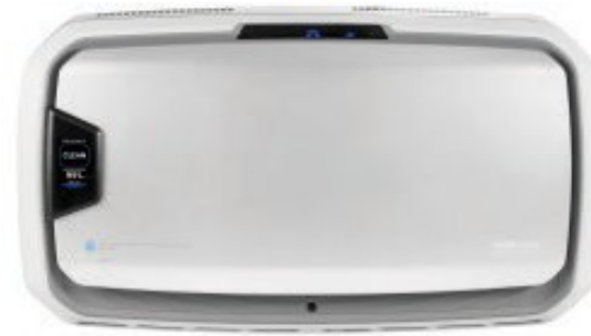
AeraMax™ Pro AM IV