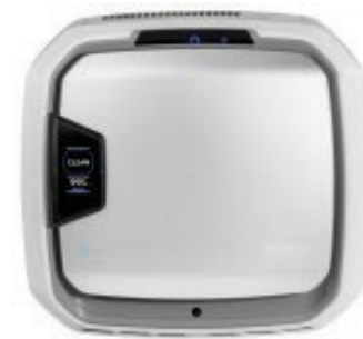
AeraMax™ Pro AM III