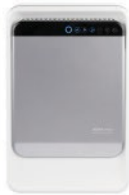
AeraMax™ Pro AM II

Improve your air with this line of professional grade air purifiers that are a proven leader to effectively eliminate up to 99.9% of contaminants. Surface cleaning only goes so far. This sophisticated technology tackles the toughest germs for a healthier environment.